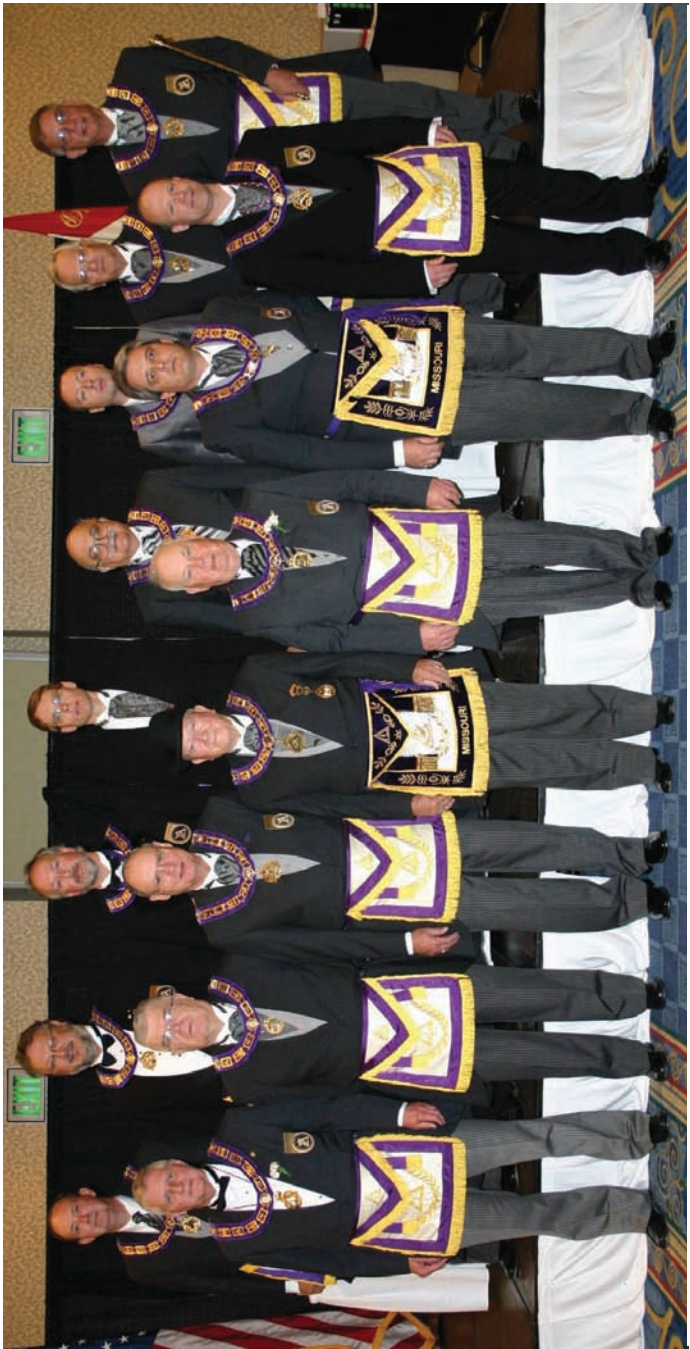
2006-2007 OFFICERS OF THE GRAND COUNCIL OF CRYPTIC MASONS OF THE STATE OF MISSOURI