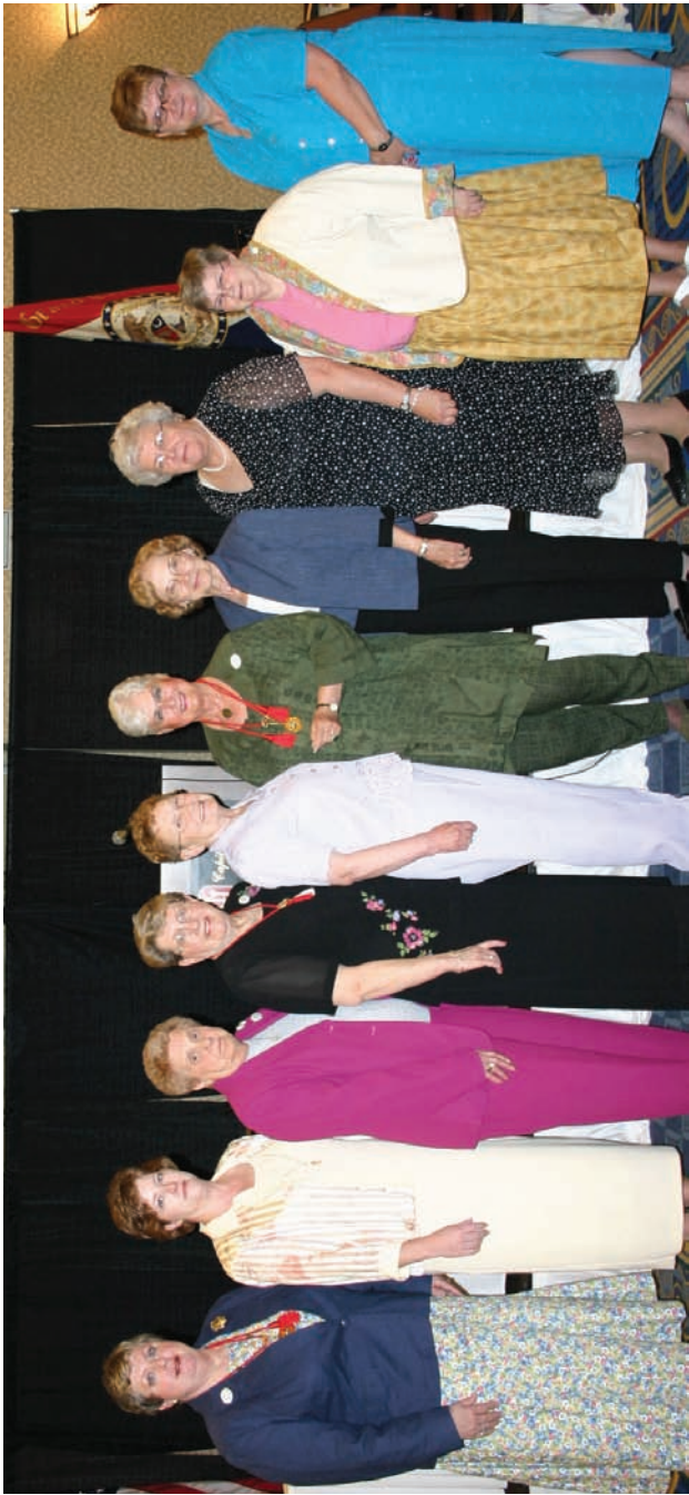
2006-2007 LADIES OF THE GRAND CHAPTER OF ROYAL ARCH MASONS OF THE STATE OF MISSOURI