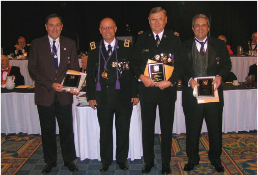
Presentation of Class C Drill Awards