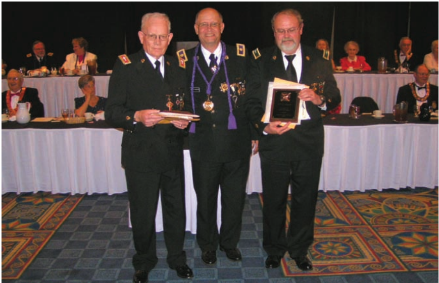
Presentation of Class A Drill Awards