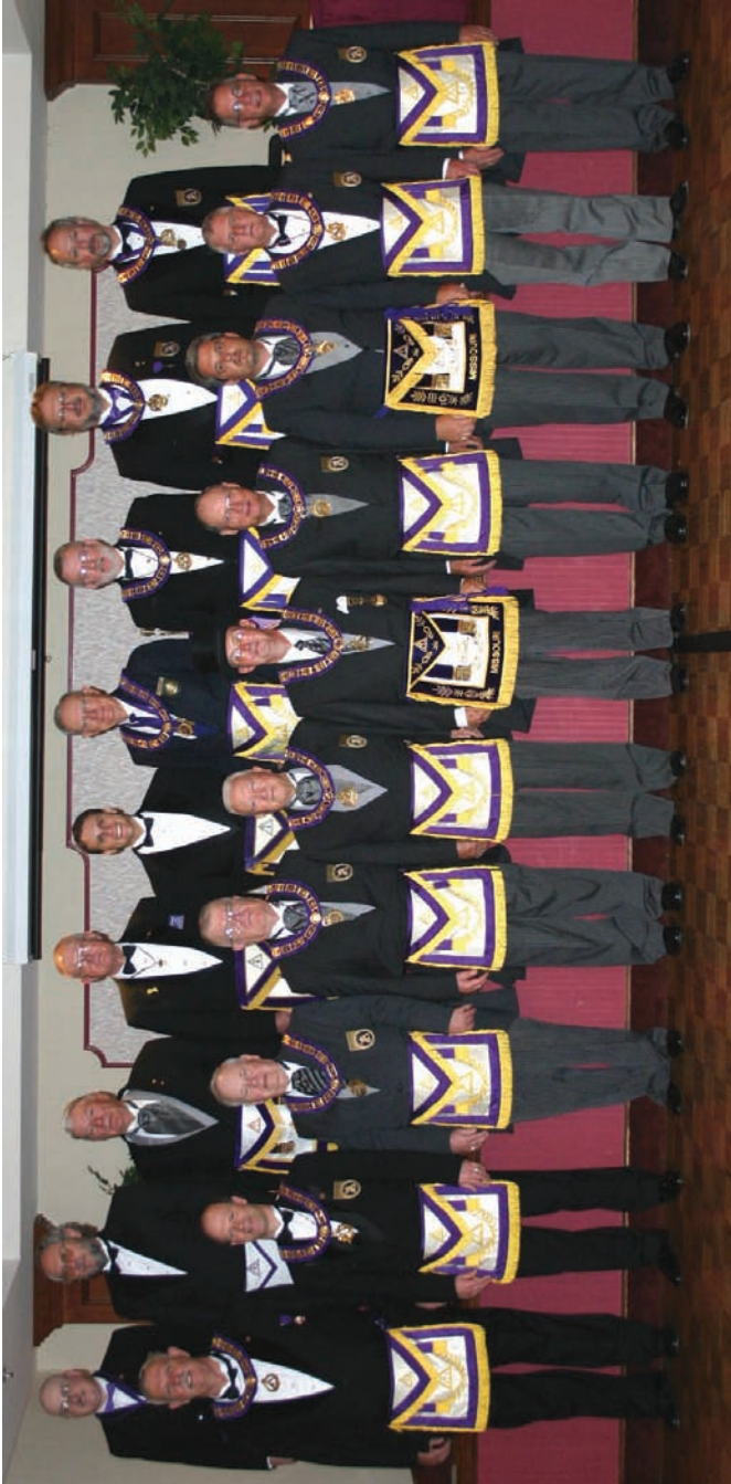
2005-2006 OFFICERS OF THE GRAND COUNCIL OF CRYPTIC MASONS OF THE STATE OF MISSOURI