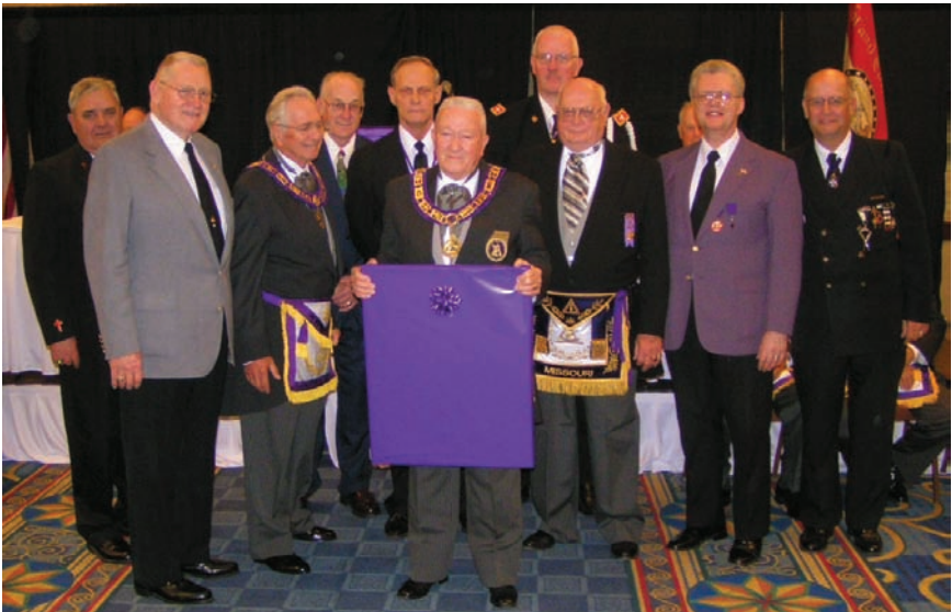
The Companions of Bonne Terre Council No. 43 present the new Grand Master with a gift.