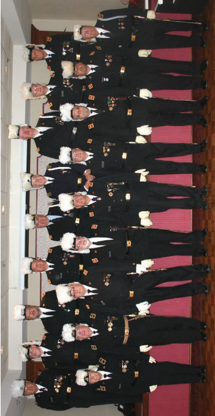
2005-2006 OFFICERS OF THE GRAND COMMANDERY OF KNIGHTS TEMPLAR OF THE STATE OF MISSOURI