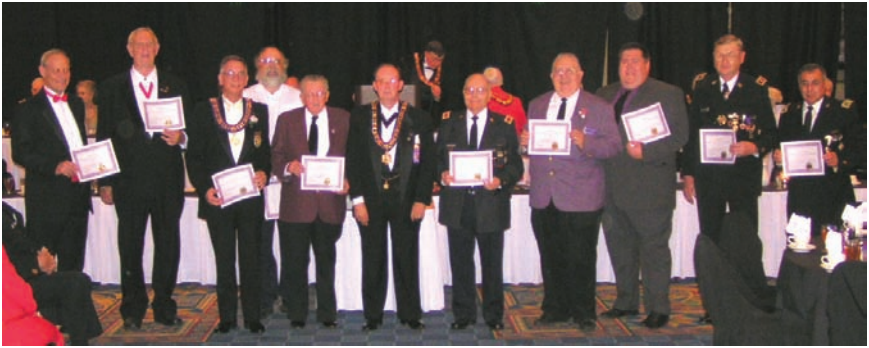
MIC Bray presents the Council Merit Awards for 2006