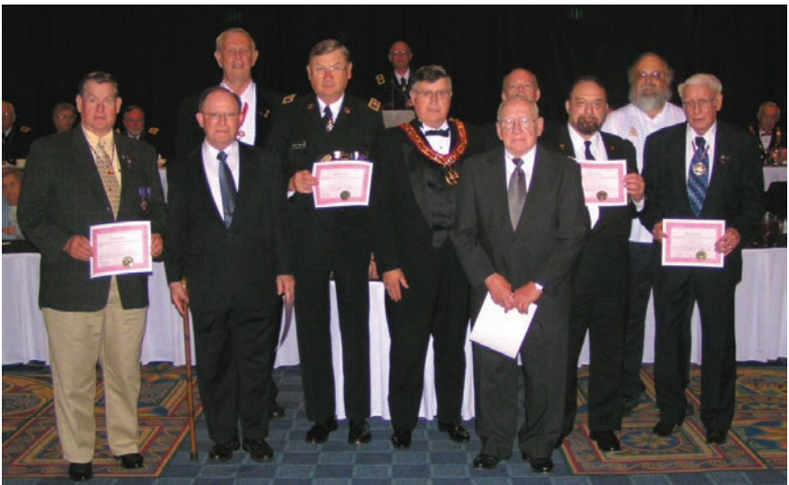
MEC Kropf presents the Distinguished Chapter Awards for 2006