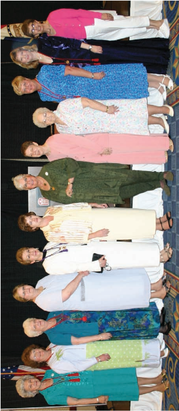
2006-2007 LADIES OF THE GRAND COMMANDERY OF KNIGHTS TEMPLAR OF THE STATE OF MISSOURI