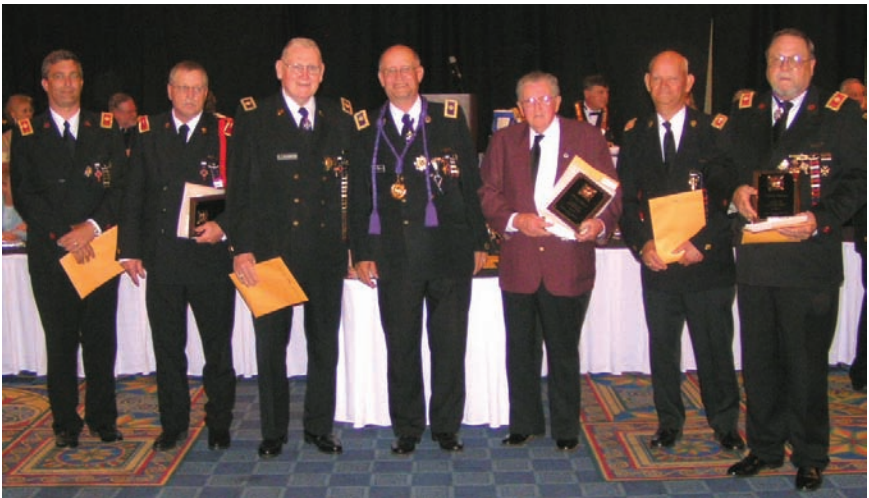
Presentation of Class B Drill Awards