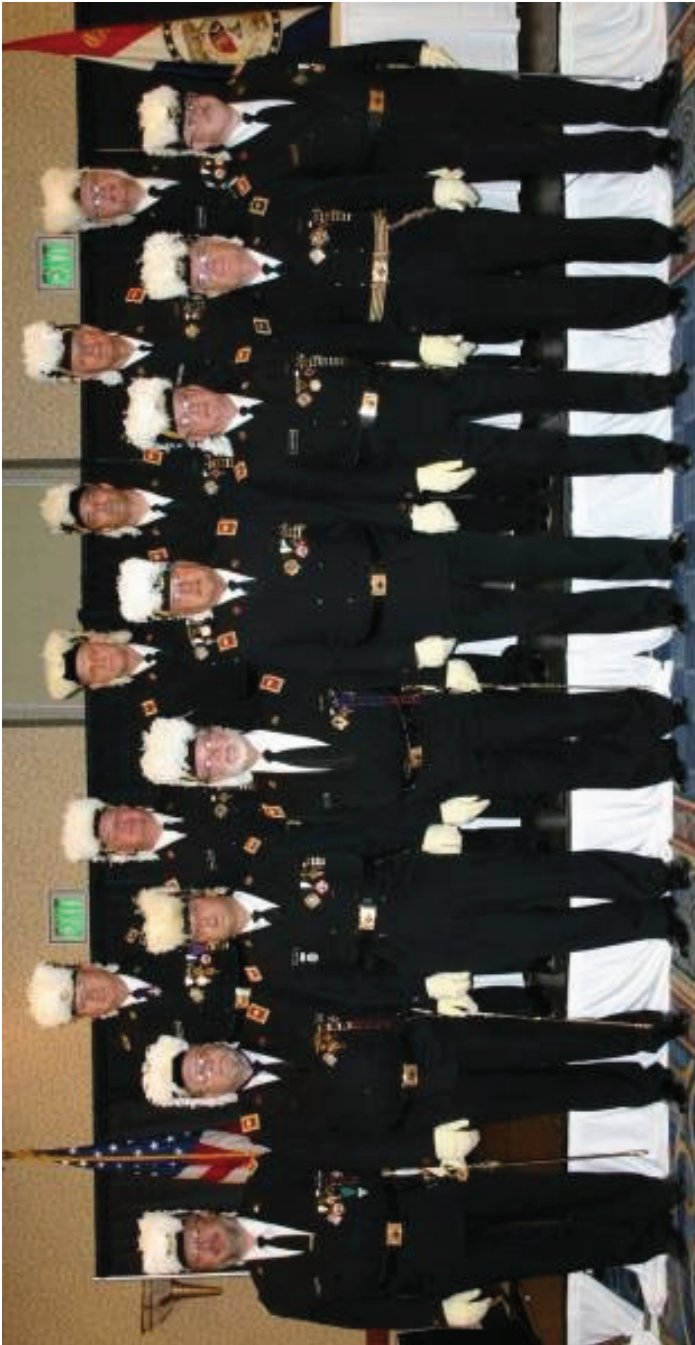
2006-2007 OFFICERS OF THE GRAND COMMANDERY OF KNIGHTS TEMPLAR OF THE STATE OF MISSOURI