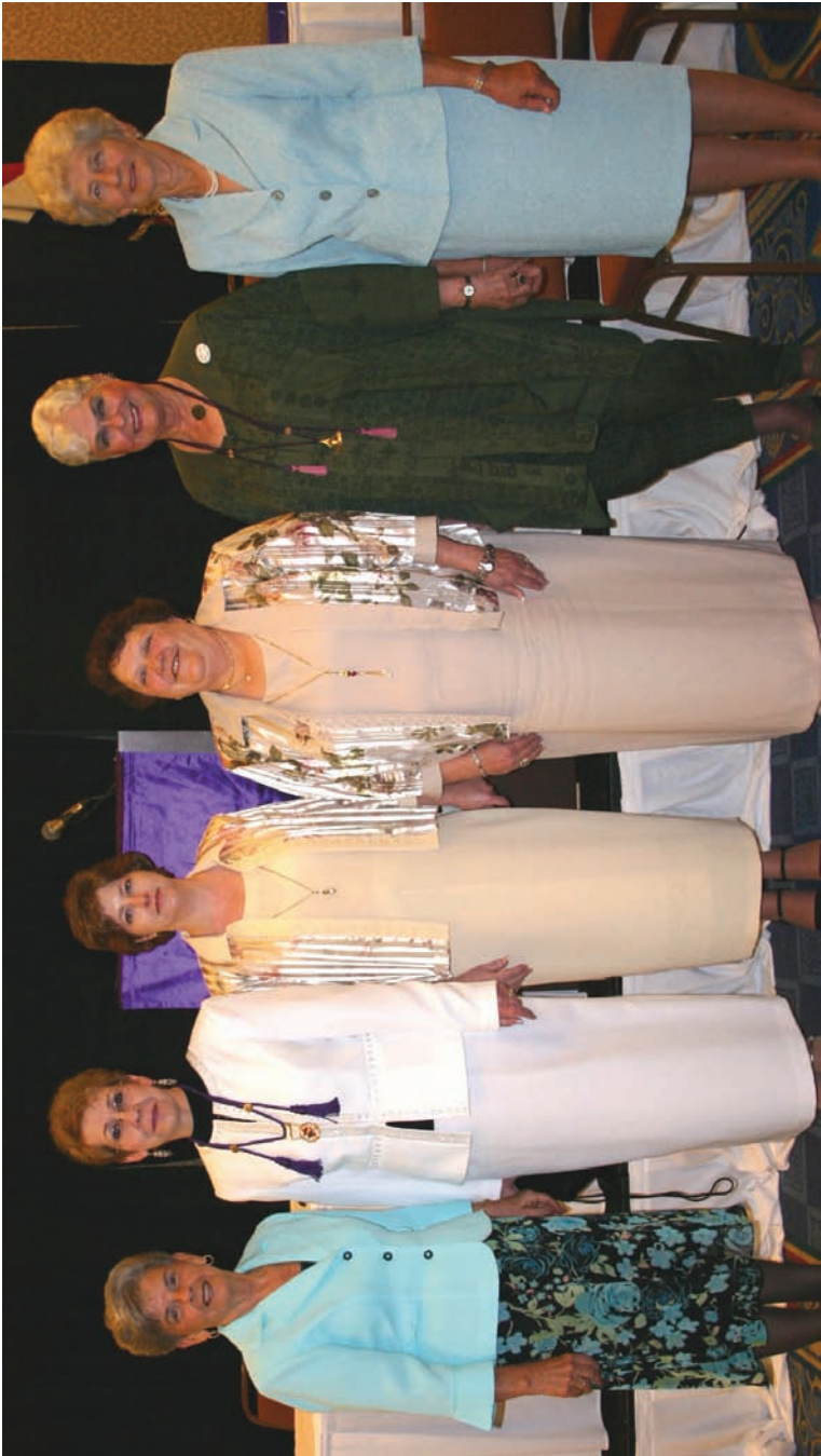
2006-2007 LADIES OF THE GRAND COUNCIL OF CRYPTIC MASONS OF THE STATE OF MISSOURI