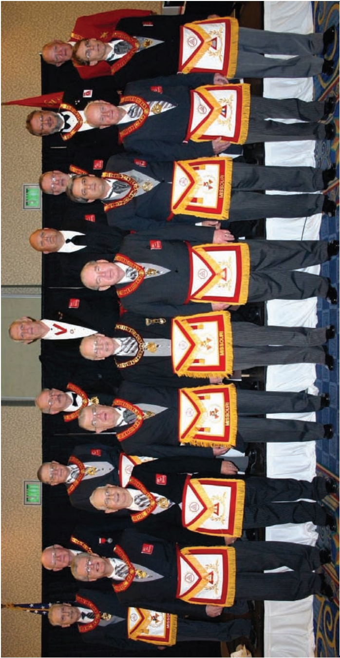
2006-2007 OFFICERS OF THE GRAND CHAPTER OF ROYAL ARCH MASONS OF THE STATE OF MISSOURI