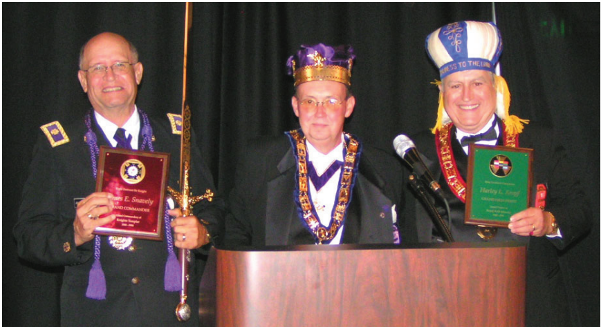
Another one for the ages...