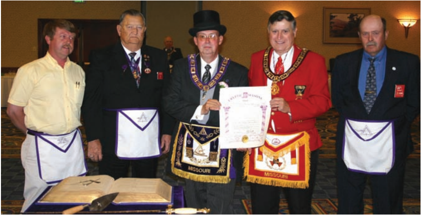
Grand Master Bray presents new charter to members of Shelby Council No. 59.