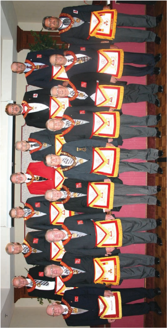
2005-2006 OFFICERS OF THE GRAND CHAPTER OF ROYAL ARCH MASONS OF THE STATE OF MISSOURI