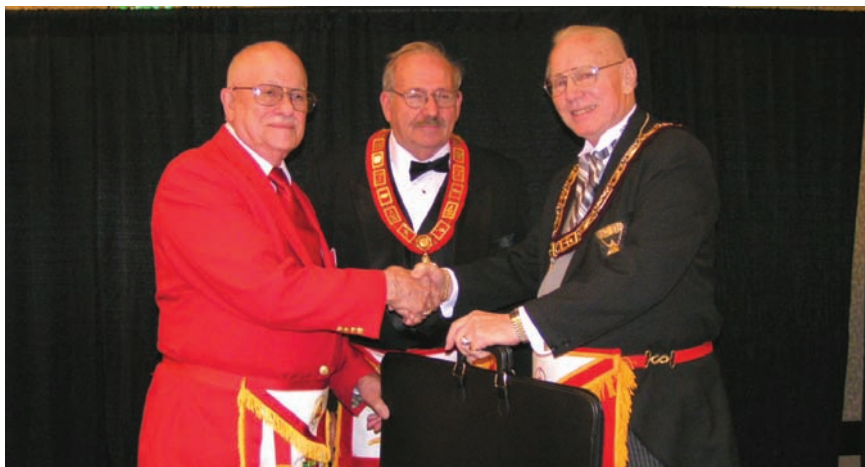
Companions of Oriental Chapter No. 78 present the Grand High Priest with a new apron case.