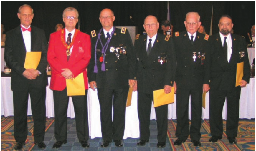
SK Snavely presents Knight of Siloam Awards