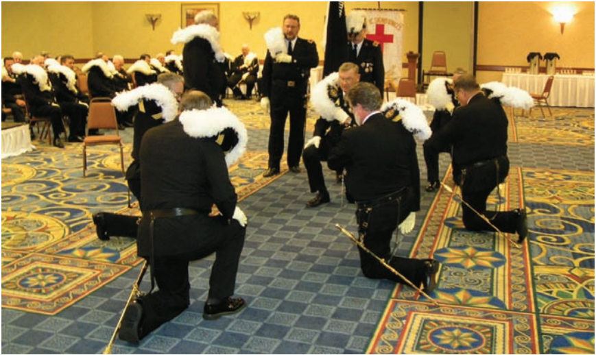
Grand Commandery opened in Class B form by the Grand Commandery Officers under the direction of the Deputy Grand Commander.