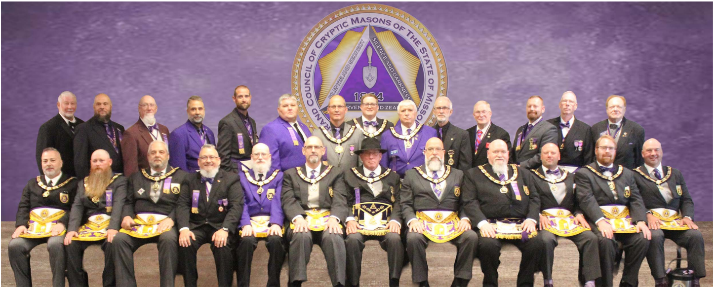
2025-2026 Grand Council Officers