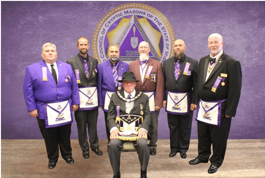
2025-2026 Grand Council Regional Grand Masters