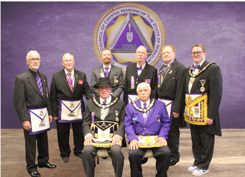
2025-2026 Grand Council Regional Grand Lecturers